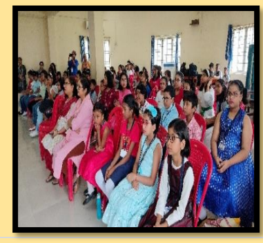
9 | Page